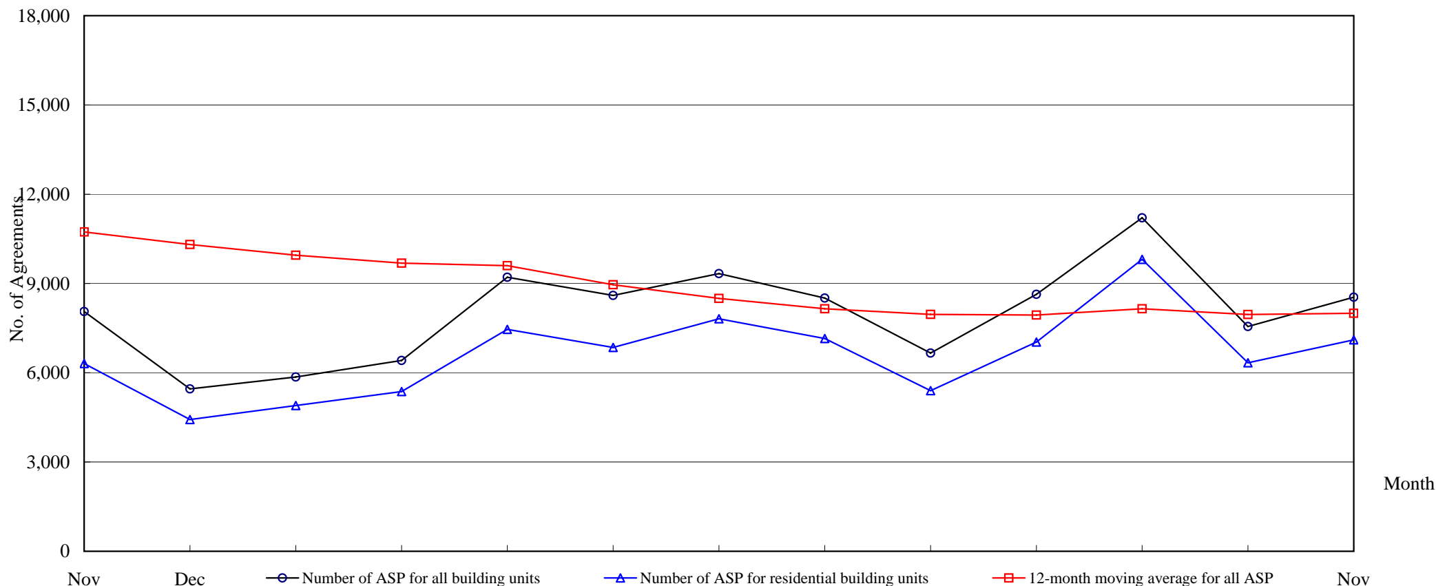
Number of Sale and Purchase Agreements of building units