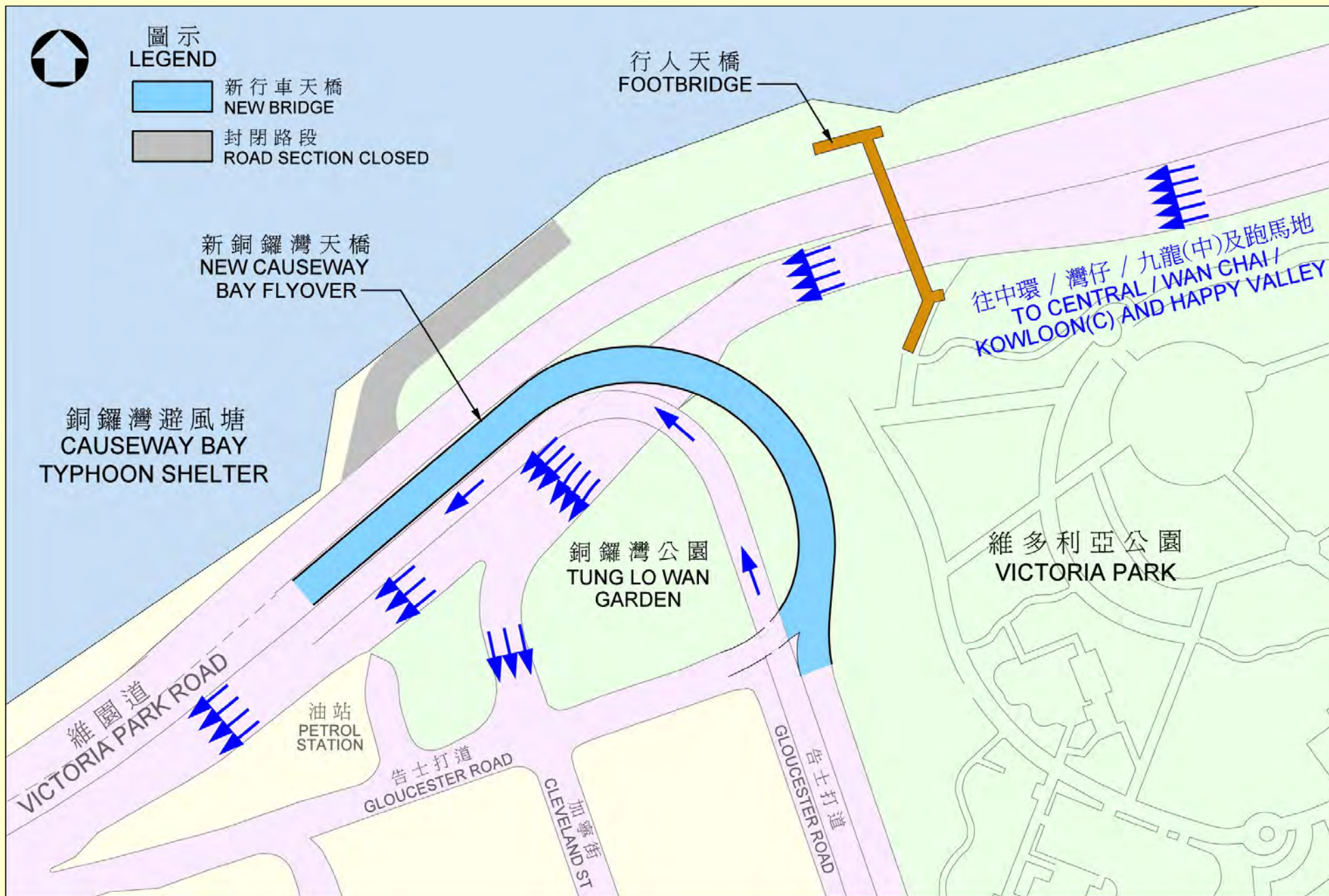
目前維園道西行車線的交通安排 Current Traffic Arrangement on Victoria Park Road westbound