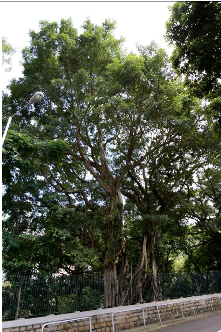
Overview of OVT ArchSD CW/6

Highlights: A native species of substantial size with a balanced and flourishing crown.