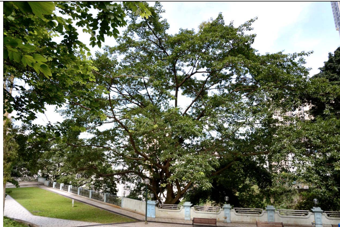
Overview of OVT ArchSD CW/3

Highlights: A native species of substantial size, with a balanced and flourishing crown, established on a stone retaining wall as a unique landscape feature