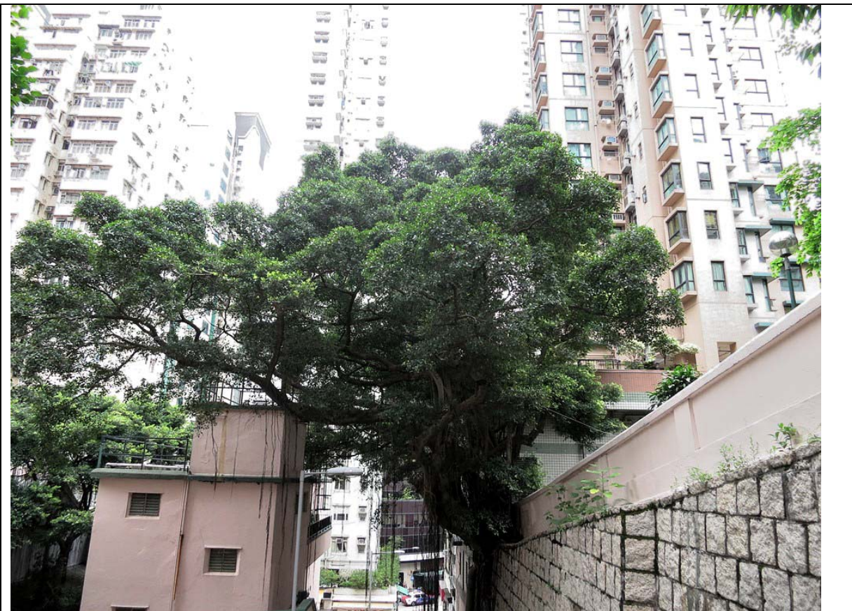
Overview of OVT ArchSD CW/5

Highlights: A native species of substantial size, with a balanced and flourishing crown, established on a stone retaining wall as unique landscape feature