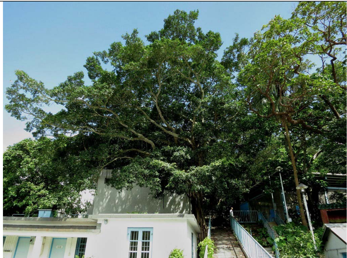
Overview of OVT ArchSD S/1

Highlights: A native species of substantial size, with a balanced and flourishing crown, established on a stone retaining wall as a unique landscape feature