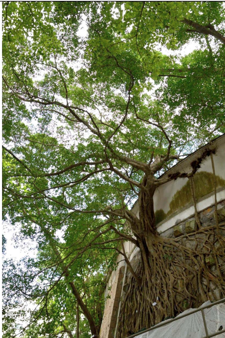
Overview of OVT ArchSD CW/2

Highlights: A native species of substantial size, with a balanced and flourishing crown, established on a stone retaining wall as a unique landscape feature