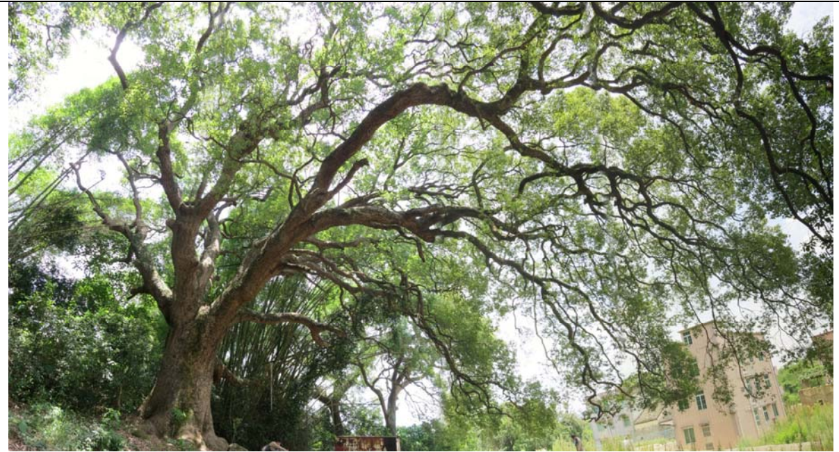
Overview of OVT AFCD/HT/024

Highlights: A native species of substantial size with a balanced form