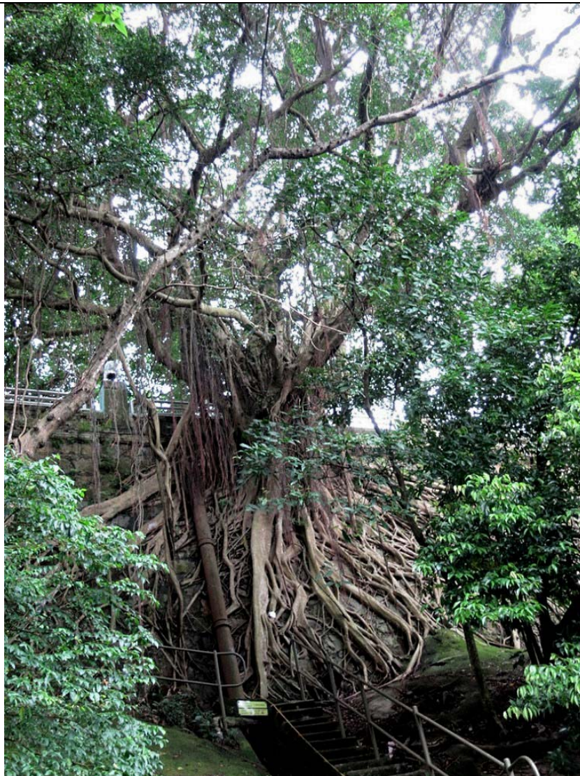
Overview of OVT ArchSD CW/4

Highlights: A native species of substantial size, with a balanced and flourishing crown, established on a stone retaining wall as a unique landscape feature