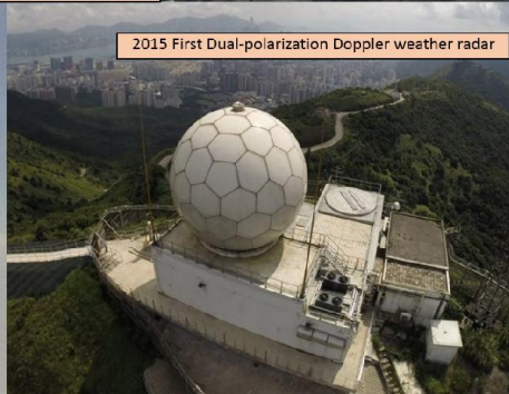
2015 First Dual-polarization Doppler weather radar