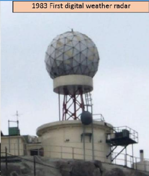
1983 First digital weather radar