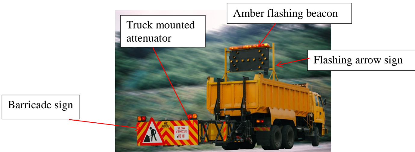
Figure 1: A shadow vehicle

When conducting mobile operations on expressways, it is necessary to use shadow vehicles. Shadow vehicles must be equipped with truck mounted attenuator, amber flashing beacon, flashing arrow sign and barricade sign. Please refer to Figure 1 for the equipment of a shadow vehicle. According to the speed limit of the road and mode of operation, the works vehicle and shadow vehicle need to maintain a proper buffer distance ( Figure 2 ). The relevant requirement on buffer distance can be found in the Code.