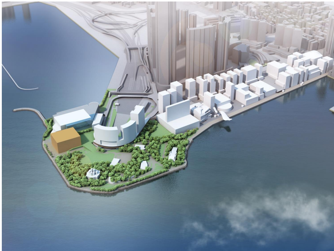
Artist Conception of the Hong Kong Palace Museum