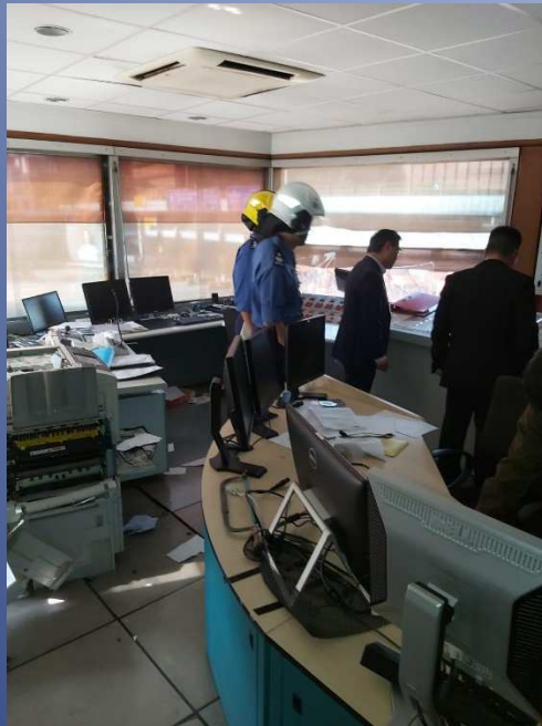
FSD officers inspect the Fire Service Installations of the Tunnel Control Room 消防處人員檢查行政大樓控制中心的消防 裝置及設備