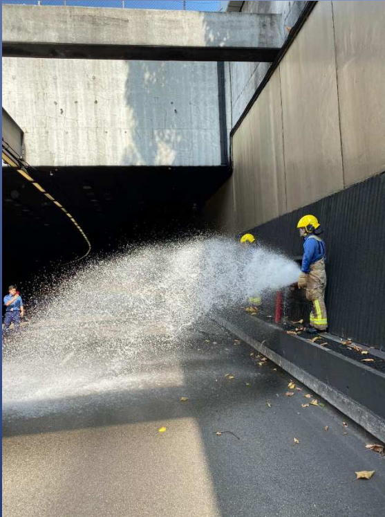
at the portal 在隧道入口

Testing of various fire hydrants of the tunnel 測試隧道內不同的消防栓