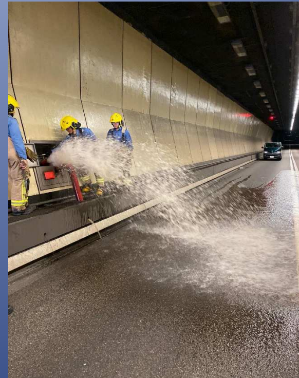
inside the tunnel 在隧道內