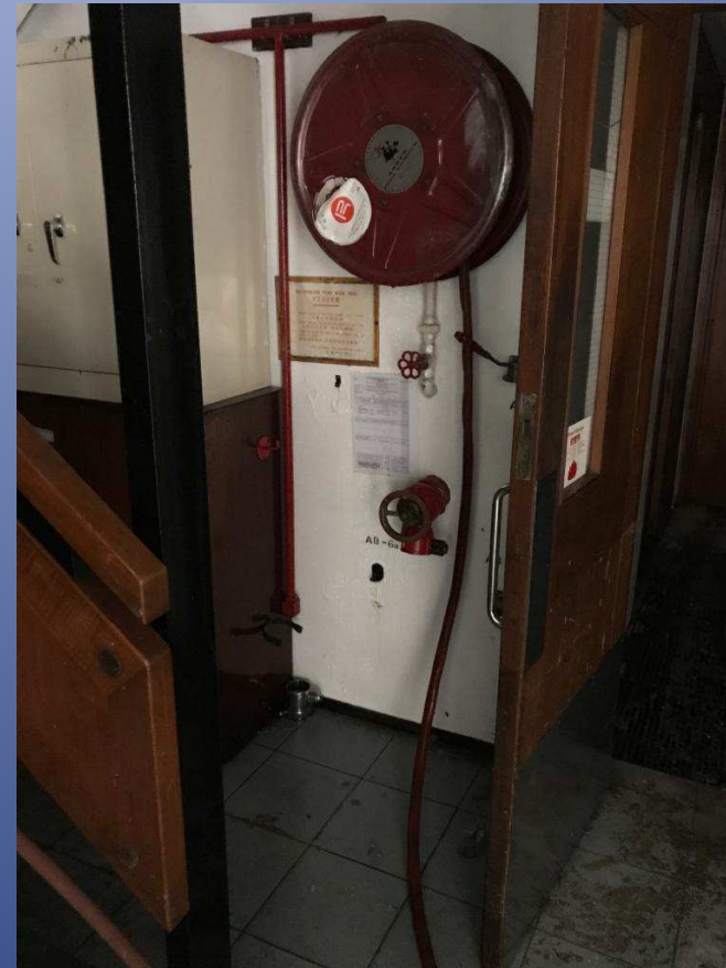
Fire hydrant/hose reel system were tampered 消防栓／喉轆系統被破壞