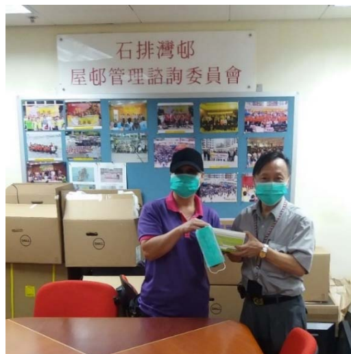
Photo 4: The Hong Kong Housing Authority has been distributing masks to cleansing workers in public rental housing estates since February.

25. In February, the Government began to set aside 700 000 masks per month for cleansing workers engaged by government contractors, in order to relieve their imminent needs. The quantity was increased to 1.81 million masks per month from May so as to ensure that each cleansing worker could have two masks per day instead of one. As of end-July, the Government has distributed over 7.8 million masks to outsourced cleansing workers.