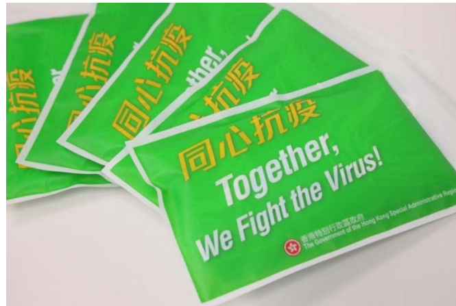
Photo 3: The first batch of around 28 million masks under the Local Mask Production Subsidy Scheme have been distributed to the public.