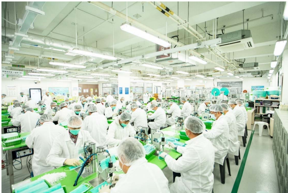
Photo 2: Off-duty and retired officers of the Correctional Services Department taking part in mask production.

19. Volunteers completed their mission at the end of May as the market supply of masks eased. The arrangement for PICs to work overnight shifts and on public holidays also ceased in early July. CSD also set up new production lines for small-size masks in early May. With their efforts, CSD supplied over 23 million masks to GLD and other departments from early February to end-July. At present, CSD supplies around 4 million masks (including 700 000 small-size masks) to GLD per month, greatly exceeding the level of supply in 2019.