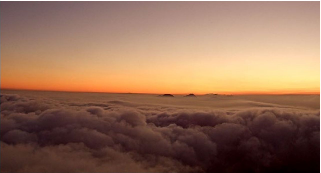
(Photo 3) The Hong Kong Observatory has added real-time weather photos taken at Tai Mo Shan to its website starting from today (August 19). Photo shows a sea of clouds in twilight captured by the new camera.