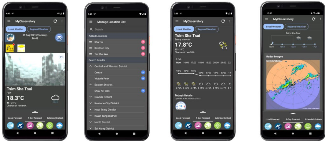
Facelifted App Home Screen