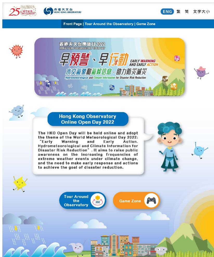
Figure 4 The Hong Kong Observatory Open Day 2022 webpage to be launched later