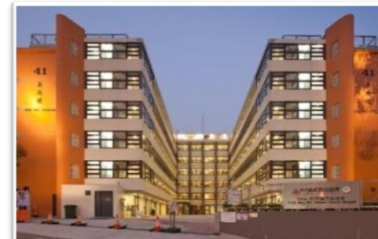
美荷樓 (YHA美荷樓青年旅舍) Mei Ho House (YHA Mei Ho House Youth Hostel)