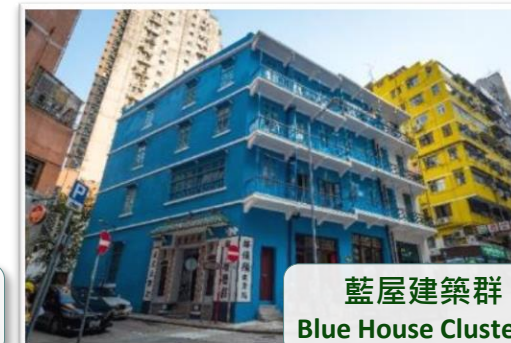
藍屋建築群 (We嘅藍屋) Blue House Cluster (Viva Blue House)