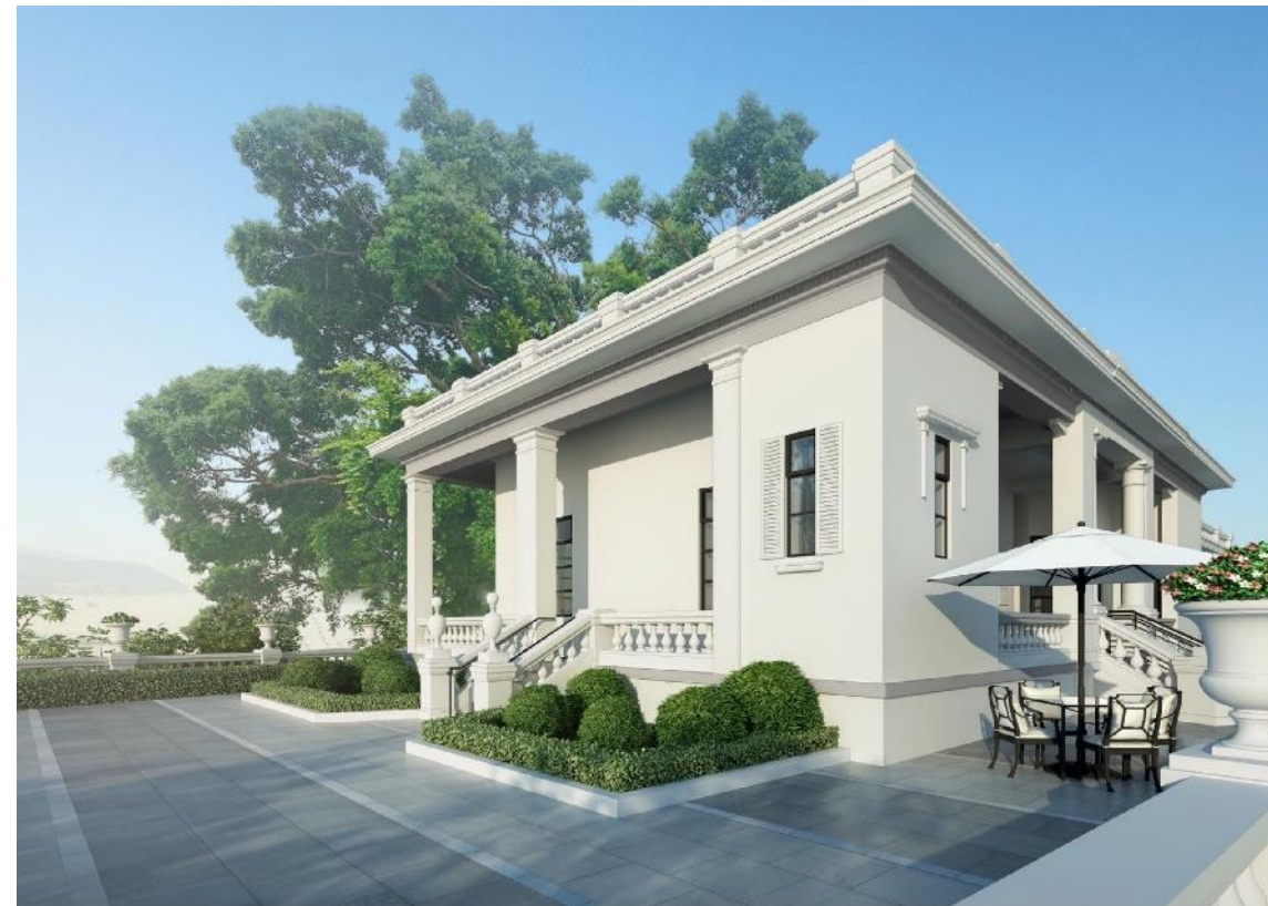
「國史教育中心悠悠館」計劃模擬圖 Artist's impression of 'CNHE Youyou Villa'