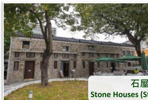
石屋 (石屋家園) Stone Houses (Stone Houses Family Garden)