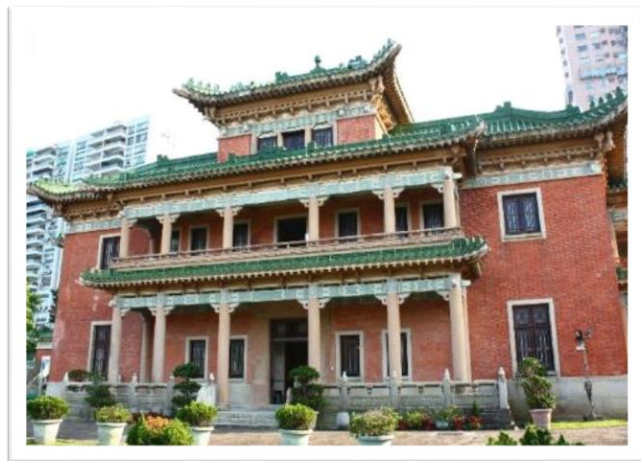
景賢里 King Yin Lei