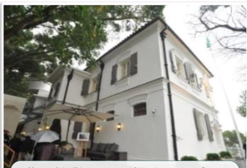
舊大澳警署 (大澳文物酒店) Old Tai O Police Station (Tai O Heritage Hotel)