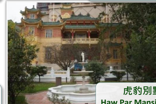
虎豹別墅 (虎豹樂園) Haw Par Mansion (Haw Par Music)