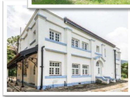
大潭篤原水抽水站員工宿舍群 Tai Tam Tuk Raw Water Pumping Station Staff Quarters Compound