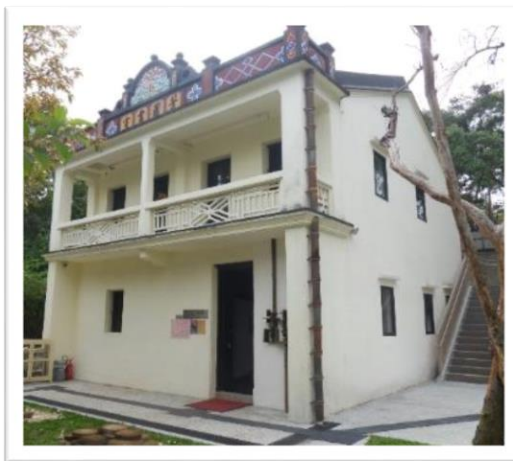
芳園書室 Fong Yuen Study Hall