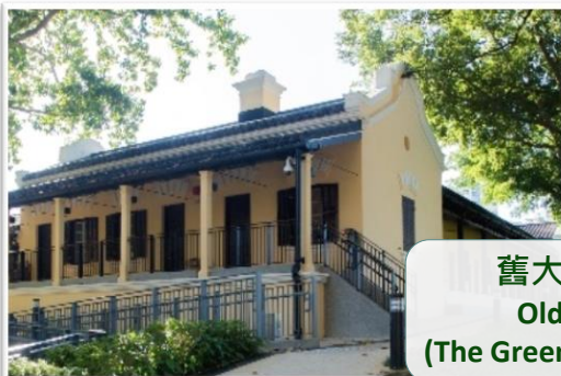
舊大埔警署 (綠匯學苑) Old Tai Po Police Station (The Green Hub for Sustainable Living)