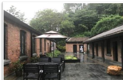
前荔枝角醫院 (饒宗頤文化館) Former Lai Chi Kok Hospital (Jao Tsung-I Academy)