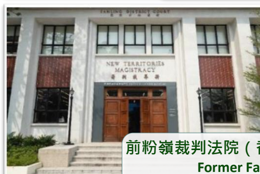
前粉嶺裁判法院 (香港青年協會領袖學院) Former Fanling Magistracy (The HKFYG Leadership Institute)