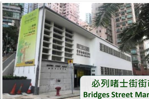
必列啫士街街市 (香港新聞博覽館) Bridges Street Market (Hong Kong News-Expo)