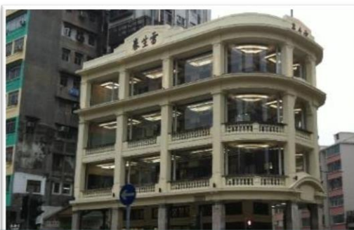
雷生春 (香港浸會大學中醫藥學院 - 雷生春堂) Lui Seng Chun (HKBU School of Chinese Medicine - Lui Seng Chun)