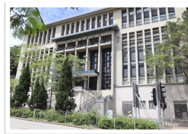
前北九龍裁判法院 Former North Kowloon Magistracy