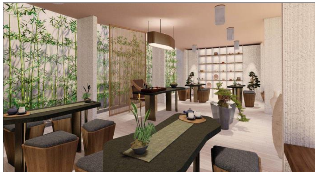
「景賢里·養生殿 - 基於普洱茶、中醫藥」計劃模擬圖 Artist's impression of 'King Yin Lei – a Healthy Living Centre based on Pu'er Tea & TCM'