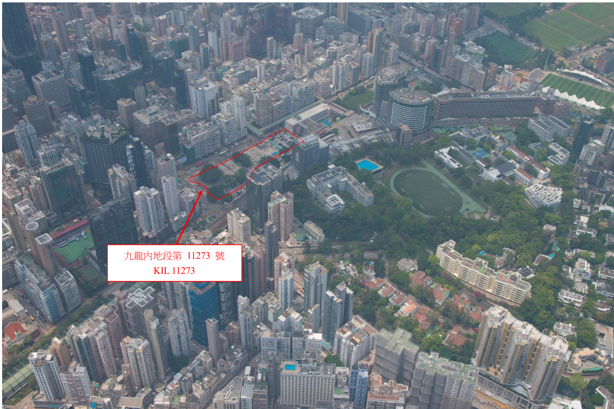
九龍內地段第 11273 號 KIL 11273