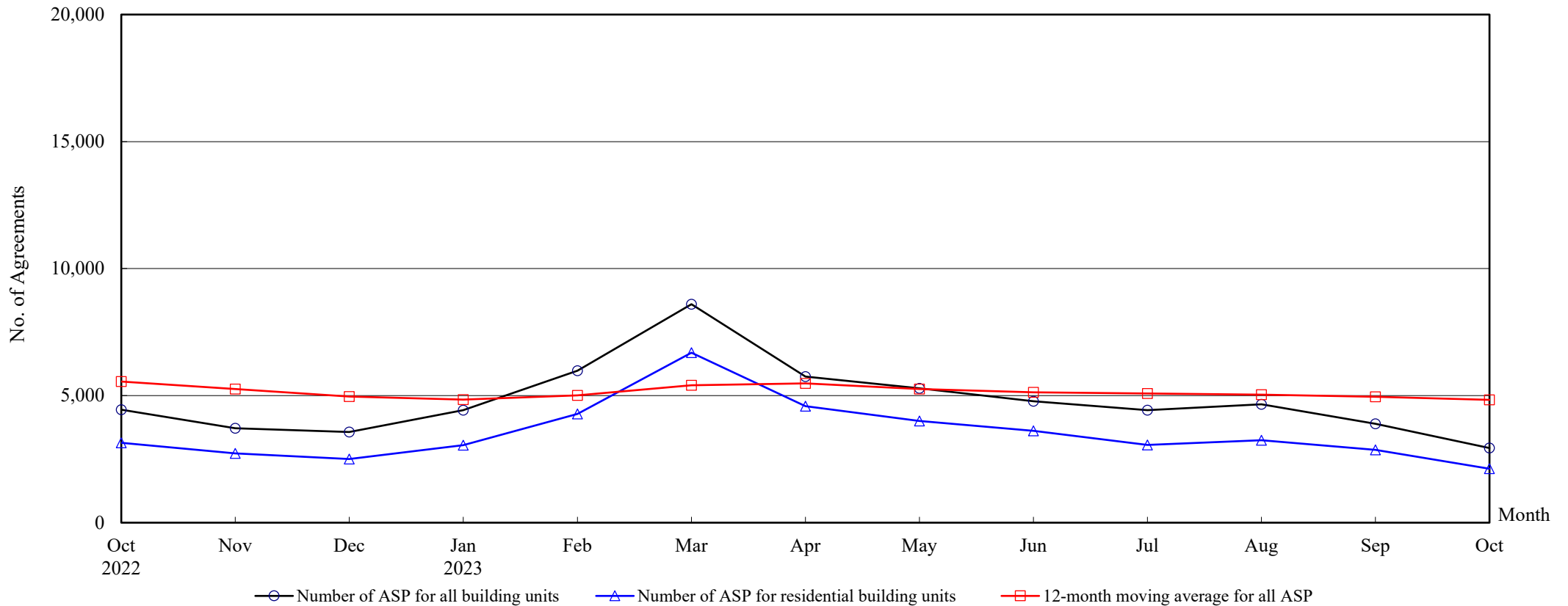
Number of Sale and Purchase Agreements of building units