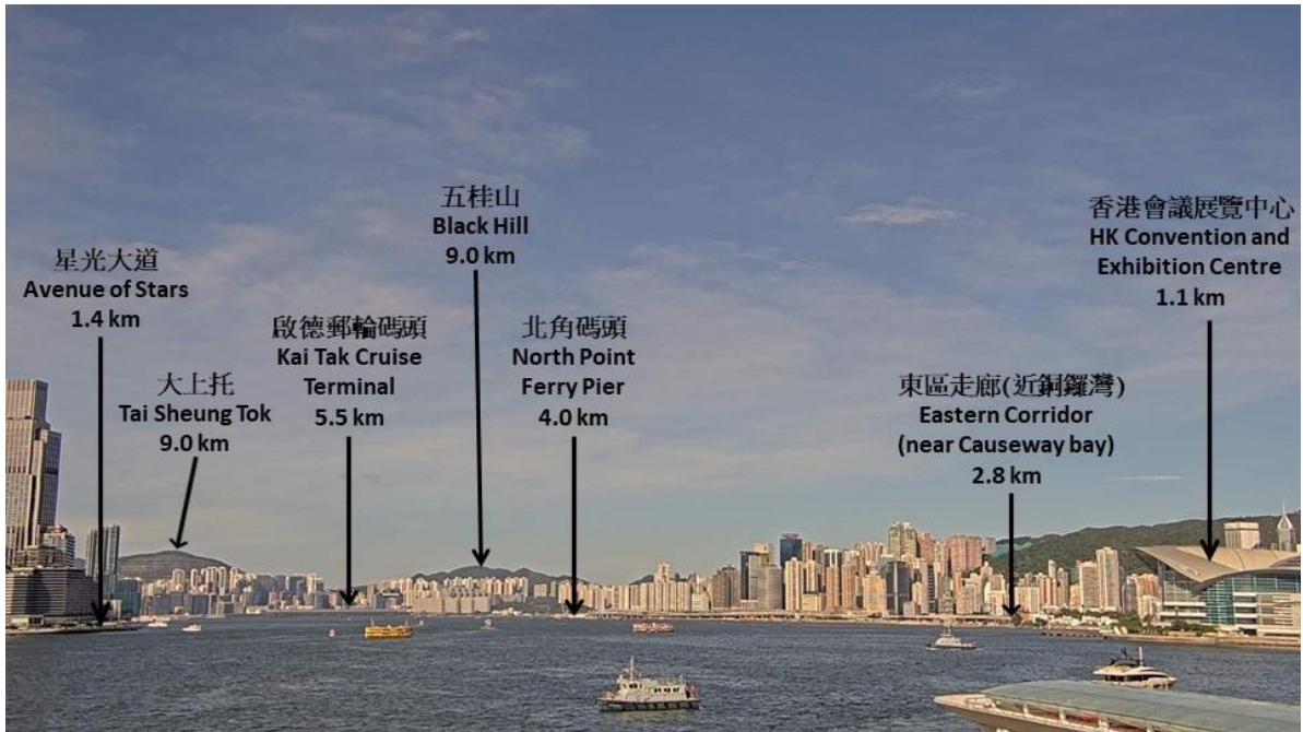
Figure 1 The Hong Kong Observatory has added real-time weather photos at the Hong Kong Maritime Museum at Central Pier today (December 13). The newly added weather camera has a wide field of view looking towards the east, facilitating the observation of weather affecting the areas around Victoria Harbour (The distance between each location and the camera is shown in unit of kilometre. The weather photo was taken at around 5pm on July 13, 2023).