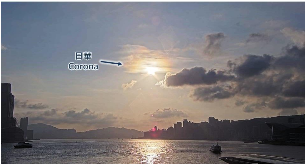
Figure 2 At around 7pm on August 17, 2023, the weather camera captured the “corona” (indicated by the arrow). When sunlight is diffracted by small water droplets or ice particles in thin clouds, one or more sequences of coloured rings centred around the Sun, forming a “corona”.