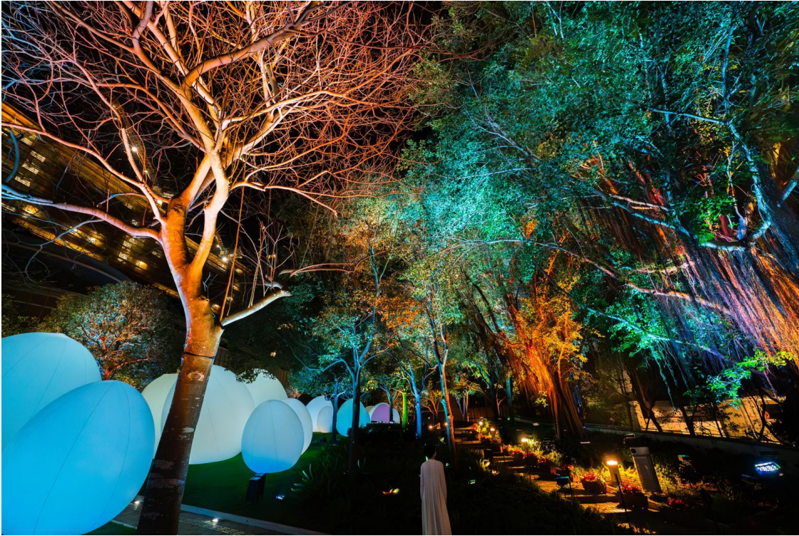
“teamLab: Continuous” 2024, Hong Kong © teamLab