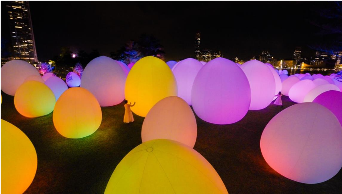
“teamLab: Continuous” 2024, Hong Kong © teamLab