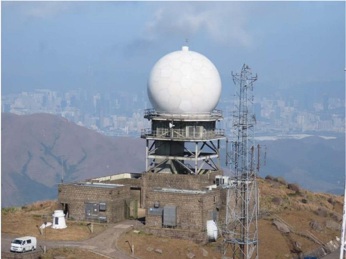
Figure 1 The new weather radar at Tai Mo Shan.