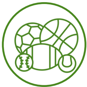
球類 Ball Games