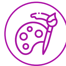
藝術文化 Arts & Culture