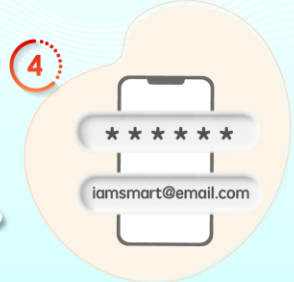
Set up password and email address (Applicable only to the registration process)