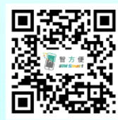
“iAM Smart” thematic website