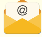
Email address (Applicable only to the registration process)