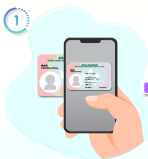
Take a front-facing photo of new smart ID card