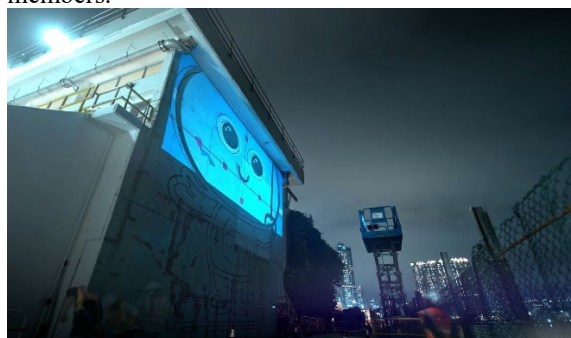
All members used their best efforts to complete the project within the target time frame.