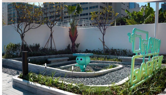
Incorporating a lot of beautification and green elements, the promenade has been transformed into a multi-purpose public space.