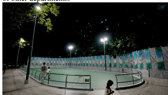
Temporary acoustic screens were installed to block the noise.