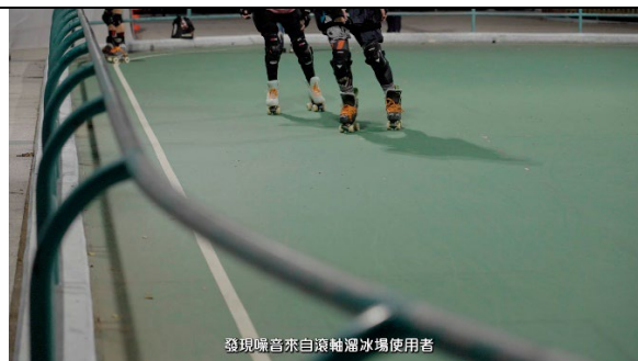
The complaint was related to the sharp screeching noise caused by roller skaters at night when they braked abruptly.

We also enlisted the Kwun Tong District Office of the Home Affairs Department to help collect views in the neighbourhood on changing the opening hours of the roller skating rink, and successfully gained its support for the implementation of the relevant measures.