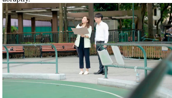
Au formulated a solution with reference to the advice of other departments.