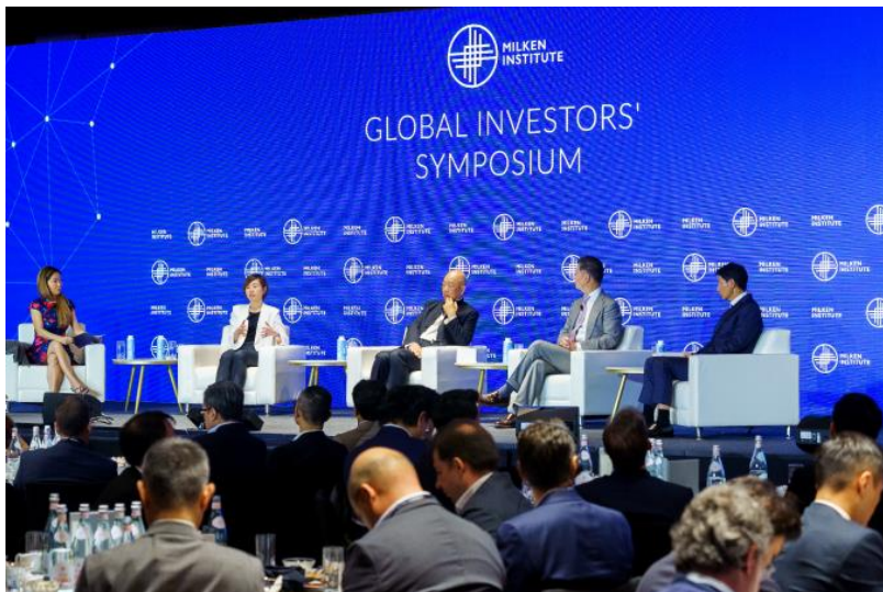
米爾肯研究院全球投資峰會 Milken Institute Global Investors' Symposium

Highlights - Finance, economy, innovation and technology related events