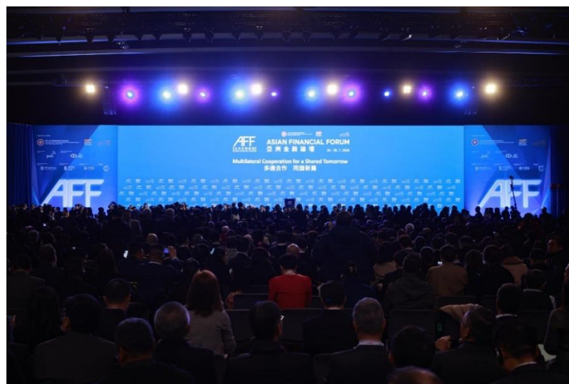
亞洲金融論壇 Asian Financial Forum