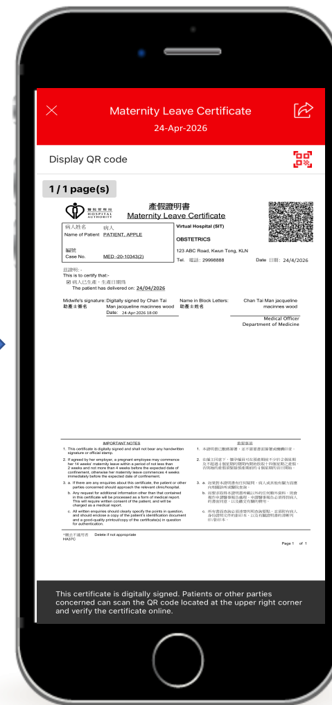
All electronic certificates are automatically stored in the “Records” feature of the HA’s mobile application HA Go.